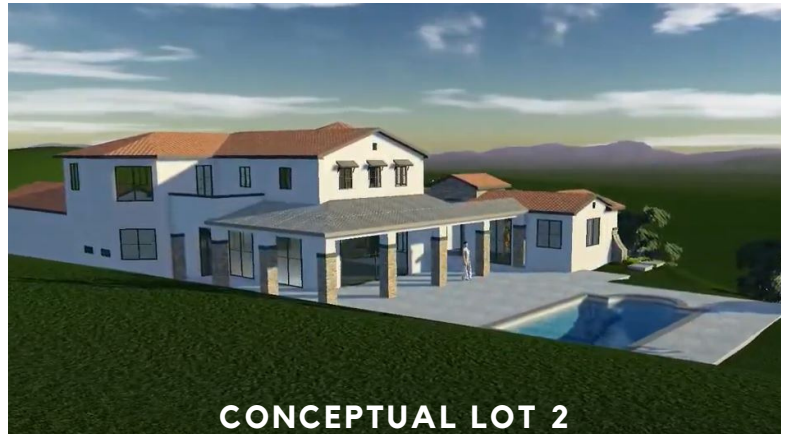
CONCEPTUAL LOT 2