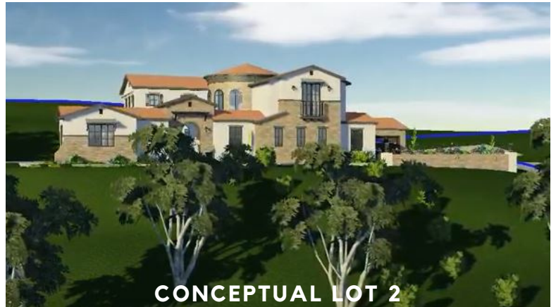
CONCEPTUAL LOT 2

This parcel of land is 1.045 acres with majestic oak and olive trees planted in the 1890's in the serene and quiet mountains of Modjeska Canyon, named after Helena Modjeska a leading lady of American Stage in the 19th and early 20th centuries it holds a piece of local history, kept famous with her Museum. Nestled in the western slope of the Santa Ana Mountains, not only does it hold a piece of history, there are nature trails and horse trails. Making it perfect for custom homes, family compound, or horse ranch.